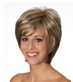
Sentoo Wig Yama

But no matter where you purchase your wig, if you want to achieve the most natural look, it's good to be informed and really understand the look you're going for, and shop accordingly.