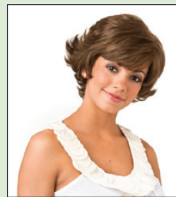
Sentoo wig Sora

We will work with you every step of the way. From the initial wig fitting all the way through the growing back stages.