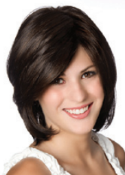
Sentoo Wig Suki

Most women who need a wig because of hair loss just want to look normal. Try on wigs that are a little longer than the length you are used to, so that your wig stylist can